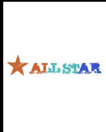
ALLSTAR Youth Engagement Partner